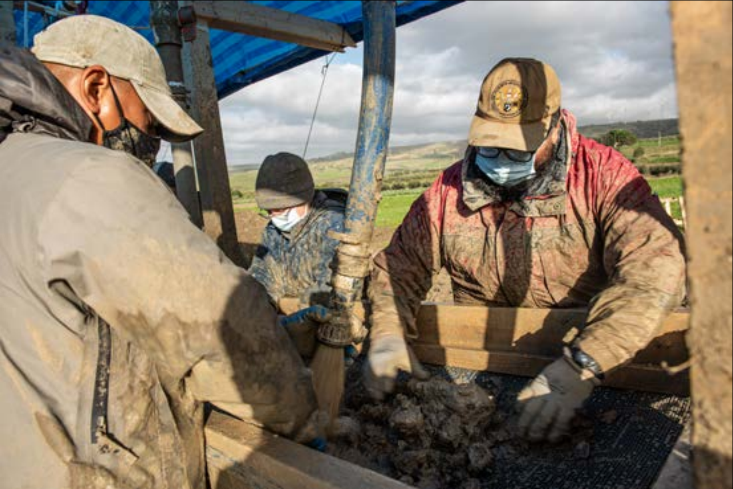
SICILY RECOVERY

DPAA service members carry a transfer case of possible remains to an awaiting U.S. Air Force C-17 aircraft during a repatriation ceremony at Savannakhet, Laos, Dec. 10, to close out a joint field activity to locate missing service members from the Vietnam War. There are currently 285 Americans still missing from operations in or over Laos during the war.