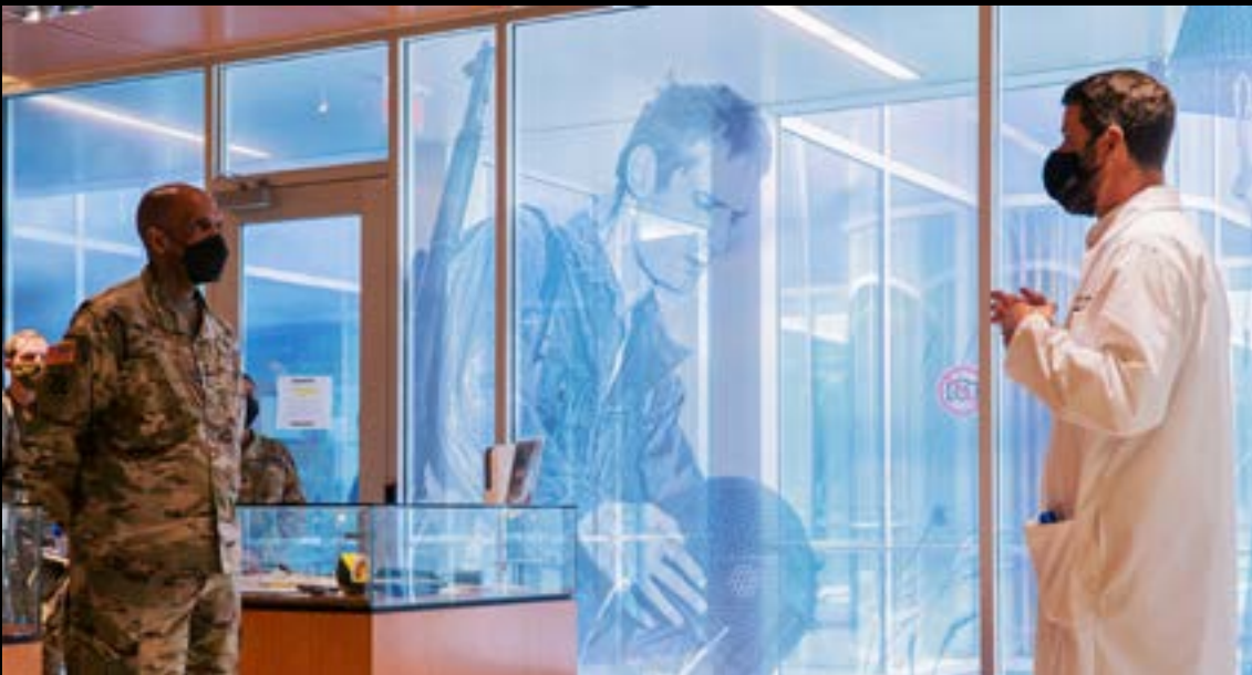
ARMY DEPUTY CHIEF OF STAFF VISIT