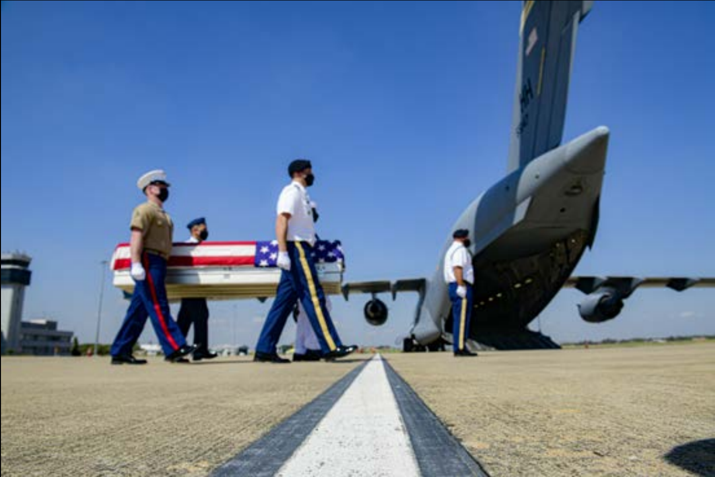
LAOS REPATRIATION

DPAA service members carry a transfer case of possible remains to an awaiting U.S. Air Force C-17 aircraft during a repatriation ceremony at Savannakhet, Laos, Dec. 10, to close out a joint field activity to locate missing service members from the Vietnam War. There are currently 285 Americans still missing from operations in or over Laos during the war.