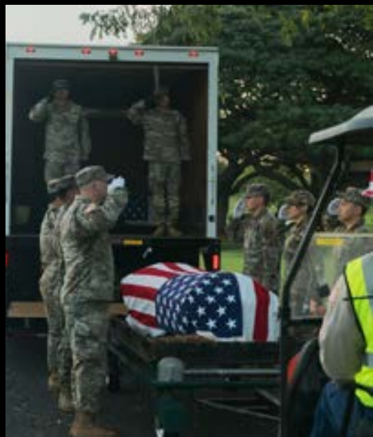
PUNCHBOWL DISINTERMENT

DPAA service members honor the fallen during a disinterment ceremony at the NMCP in Honolulu Jan. 24. The disinterred remains will be transferred to DPAA's Hawaii laboratory for identification.