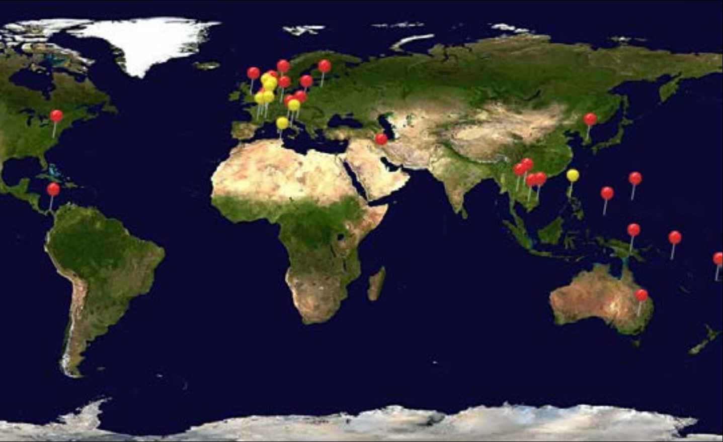
The red pins in the map indicate locations where DPAA conducted investigation or recovery missions. The yellow pins represent disinterments locations.

An Official Turnover of Possible Remains of U.S. Personnel packet rests on a table during a DPAA repatriation ceremony in the Lao People's Democratic Republic, Nov. 2