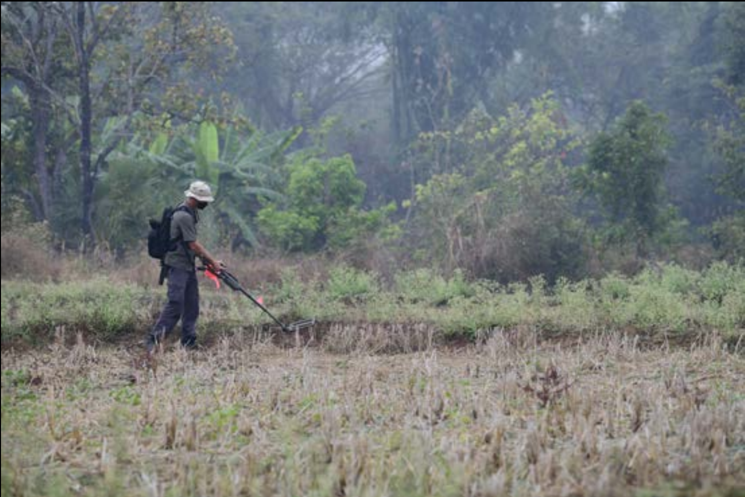
THAILAND RECOVERY